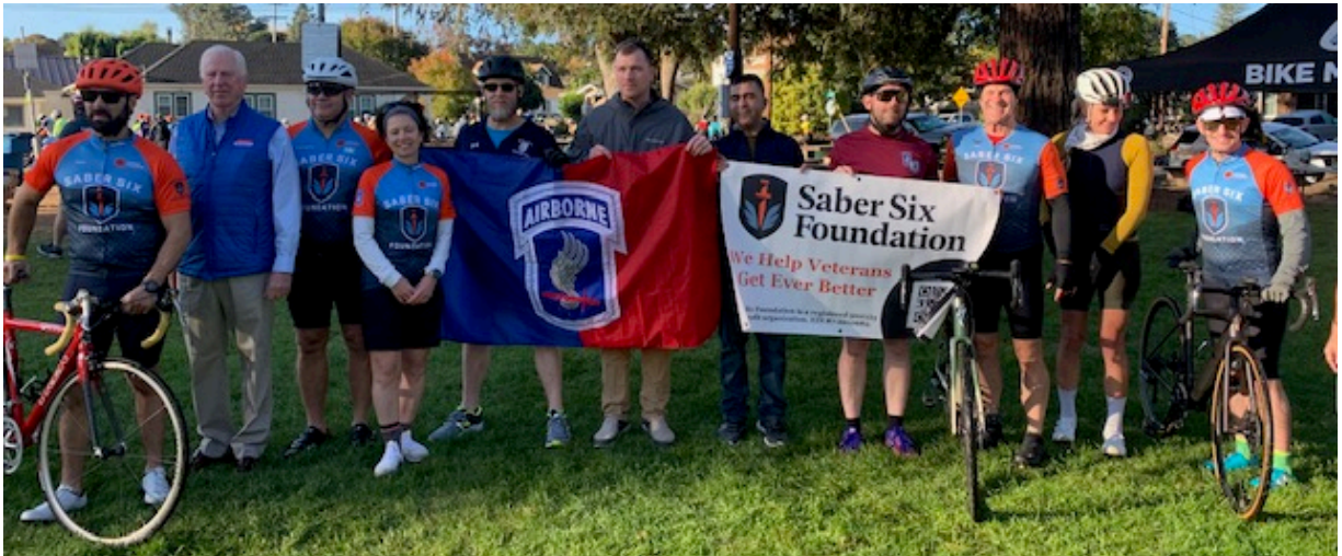
2023 Pedals & Parachutes Veterans Day Reunion Weekend Benefit Bike Ride