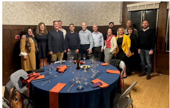
Saber Six Foundation veterans, supporters and staff enjoy the Welcome Dinner

The Pedals and Parachutes Veterans Day Benefit Bike Ride and Parade , was supported with a kickoff by California Congressman Mike Thompson (173rd Airborne, Vietnam). Olympic Cyclist Alison Tetrick supported us in recruiting cyclists; she attended our dinner the previous night and joined us during and after the ride. Specialized Bicycle Components provided water bottles, t-shirts and a dozen bicycles for Saber Six Veterans. Assos, Switzerland donated branded bags for riders and two riding outfits.