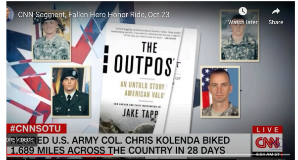
Jake Tapper features The Fallen Hero Honor Ride on CNN