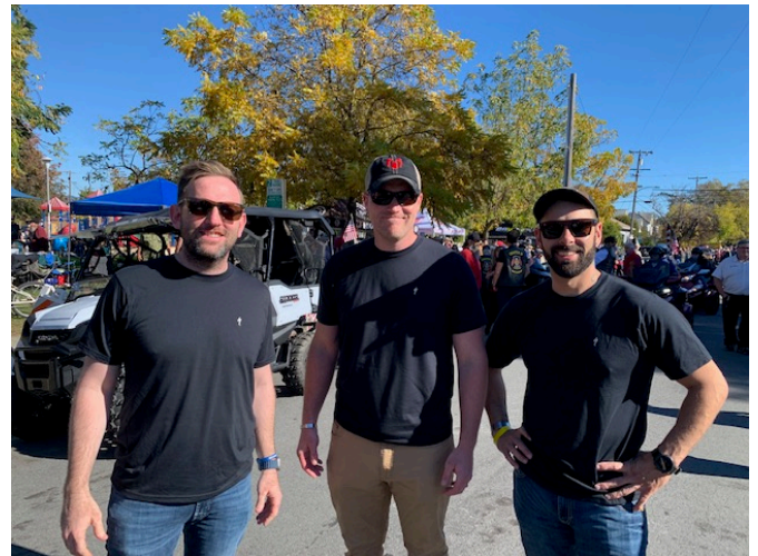
TF Saber Veterans at the reunion, Petaluma, CA

“That’s one of the things that’s so important to me with Saber Six is that we are creating programs that help soldiers transition into normal life and create Ever-Better lives.”