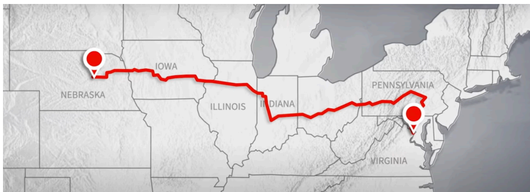
The 1700-Mile Fallen Hero Honor Ride